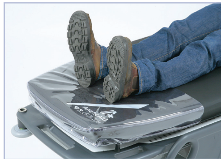
Foot-end Mattress Protector