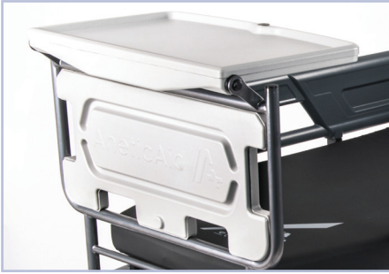
Monitor Shelf with Removable Refreshment Tray