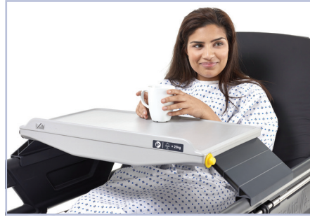
Removable Refreshment Tray