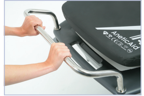
Push / Pull Bar