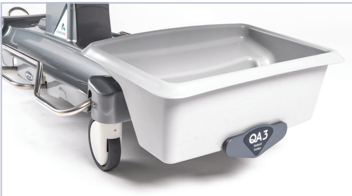
Patient's Storage Container